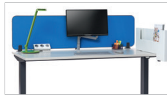
Screen on Desk