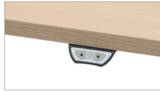
Up/Down User Interface