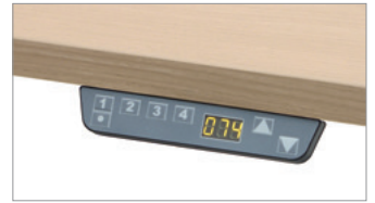
Programmable User Interface