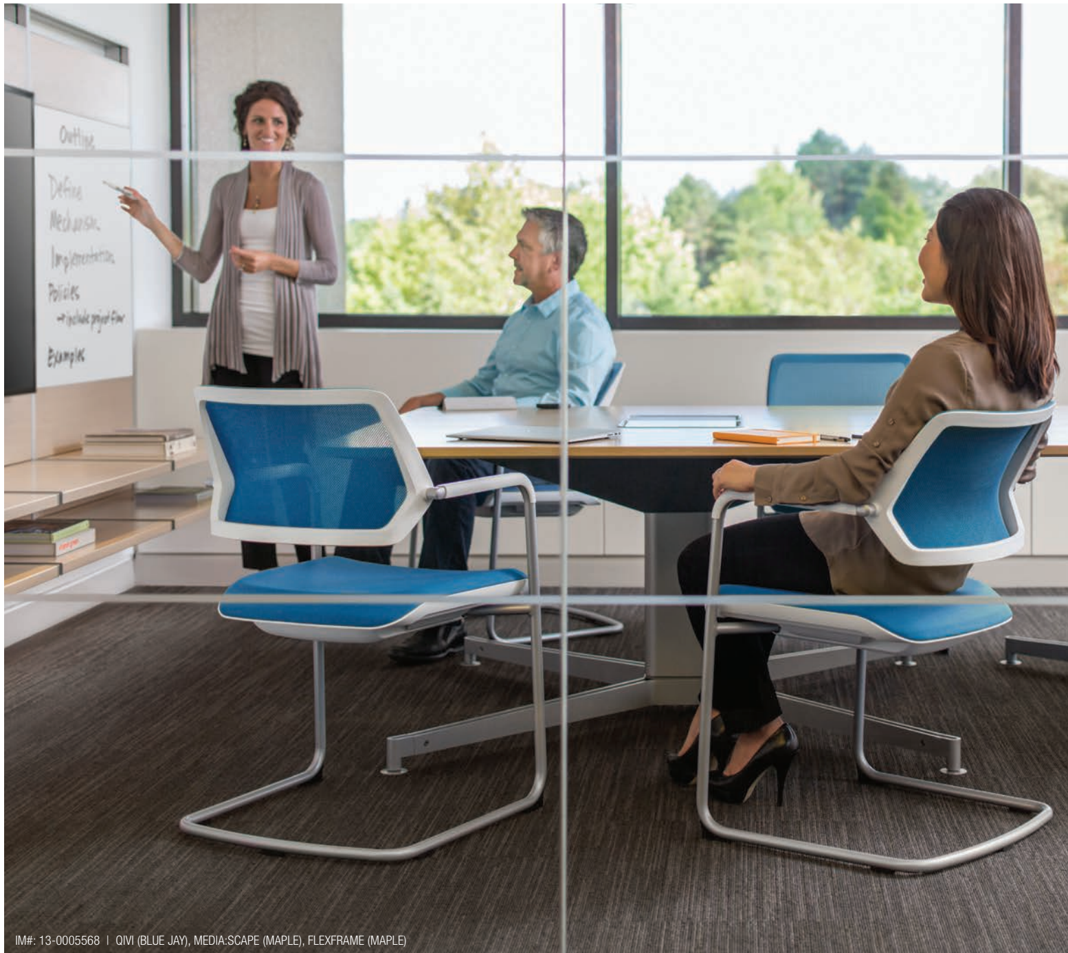
IM#: 13-0005568 | QIVI (BLUE JAY), MEDIA:SCAPE (MAPLE), FLEXFRAME (MAPLE)