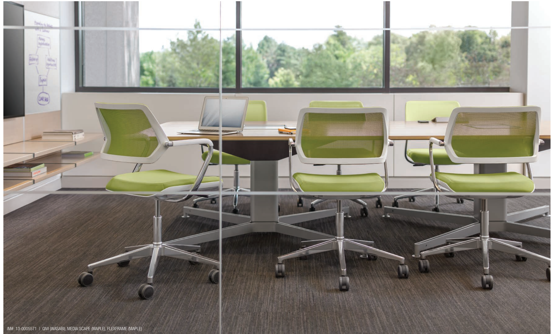
IM#: 13-0005571 | QIVI (WASABI), MEDIA:SCAPE (MAPLE), FLEXFRAME (MAPLE)

People don't just sit in meetings. They interact, brainstorm and create. Qivi, an intelligently designed collaborative chair, encourages movement, supports multiple postures and provides comfort for extended periods of time—fostering collaboration in a variety of settings.